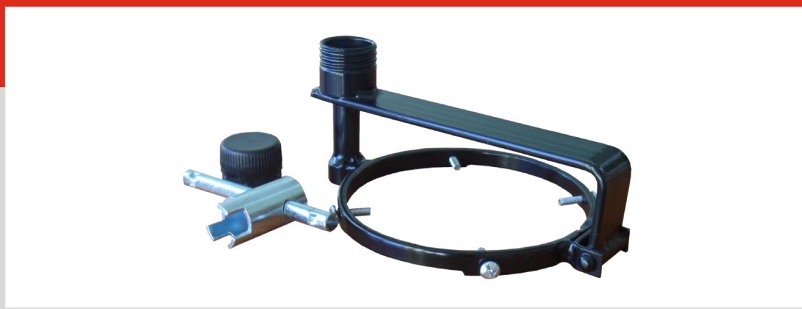
An anti-theft steel lock for a fuel tank, diameter 80mm.